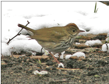
A record-early Ovenbird in the snow, at Sanctuary Picnic Area on April 15, 2014