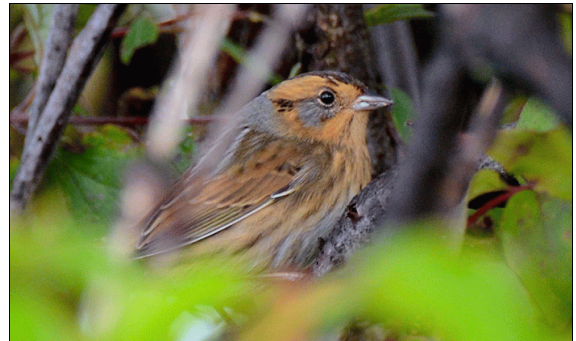
Nelson's Sparrow at the extreme Tip on September 30, 2014 — Lev A. Frid

September 30 — one, extreme Tip (LAF, Marina Lachtchenko) October 19 — one, Sparrow Field (STP)