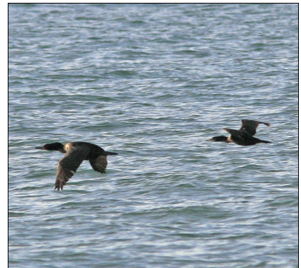
Neotropic Cormorant (right) at the Tip on June 1, 2014. Note the smaller head and body size, and thinner bill