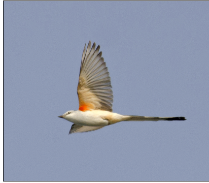
Scissor-tailed Flycatcher flying over the Tip on May 11, 2014