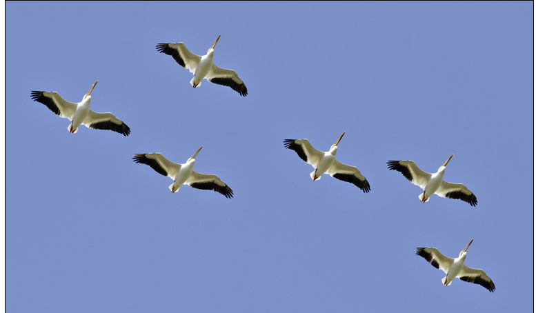
Six American White Pelicans flying in formation over Hillman Marsh on May 24, 2014