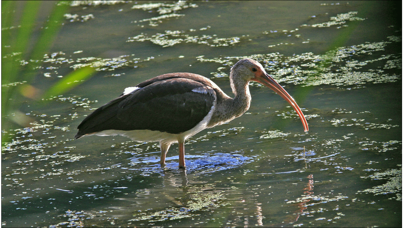
Establishing just the second record for the Point Pelee Birding Area, this juvenile White Ibis remained at Wheatley Provincial Park (Boosey Creek) from September 14-16, 2014 — Alan Wormington