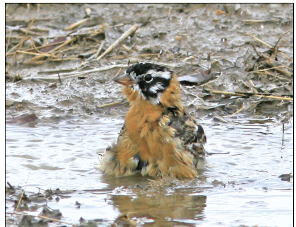
Male Smith's Longspur on April 29, 2014 — Alan Wormington