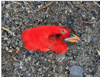
The head of a male Scarlet Tanager found at the Tip on April 18, 2014