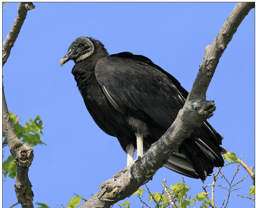
Black Vulture roosting at the Sparrow Field (with 44 Turkey Vultures nearby) on June 1, 2014

May 9 — one dead (very fresh), Pelee Drive @ The Narrows (BRH et al. )