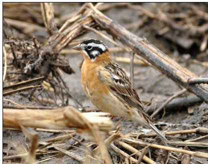
Male Smith's Longspur on April 29, 2014 — Kory J. Renaud