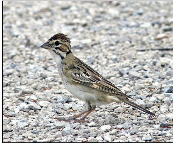
Immature Lark Sparrow at the west side of Tip, from August 22-24, 2014 — Alan Wormington

October 9 — one adult, west side of Tip (RPC) October 12 — one, west side of Tip (Gerald Urquhart)