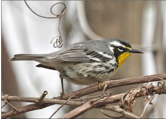
Yellow-throated Warbler (nominate dominica ?) at East Beach on May 10, 2014 — Bruce M. Di Labio