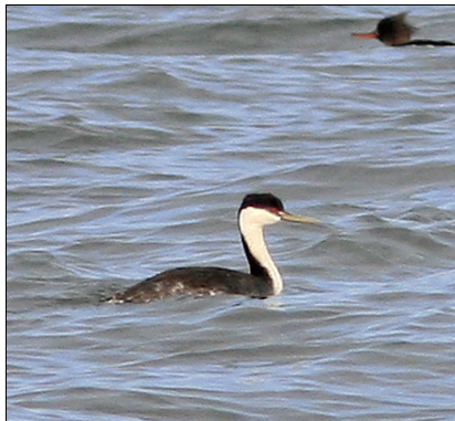
Western Grebe at the west side of the Tip on April 29-30, 2014 — Alan Wormington