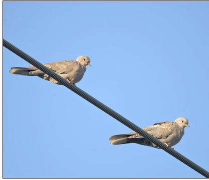
Two Eurasian Collared-Doves at Gore Hill on August 29, 2014