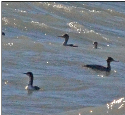
Juvenile Pacific Loon at the Tip (front left), feeding with Red-breasted Mergansers on October 26, 2014