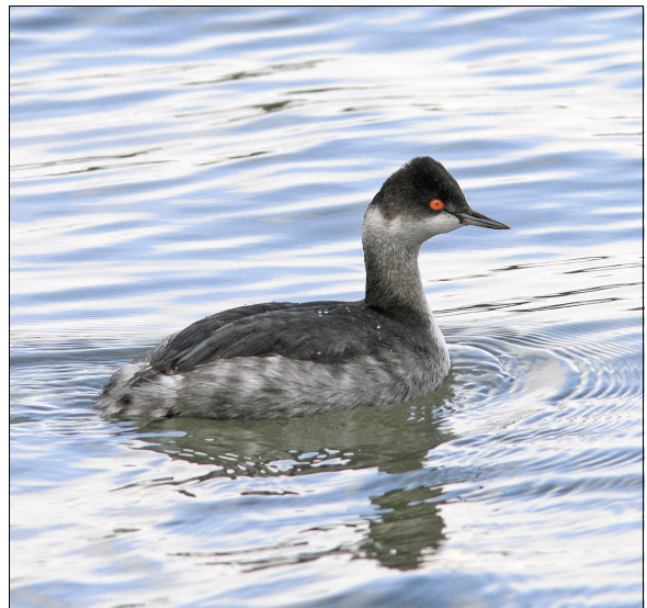
Adult Eared Grebe at Wheatley Harbour on November 17, 2014

November 9-10 — one, east side of Tip (KGDB et al. )