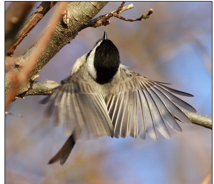
Three views of the Carolina Chickadee, south of the Sparrow Field on May 13, 2013 — Brandon R. Holden

On the centre image, note the complete absence of any “peach” colouring along the flanks, and also the lower edge of the black “bib” which is relatively sharply-defined from the white underparts (a variable trait); in the image on the right, note the complete lack of any white markings on the greater (wing) coverts.