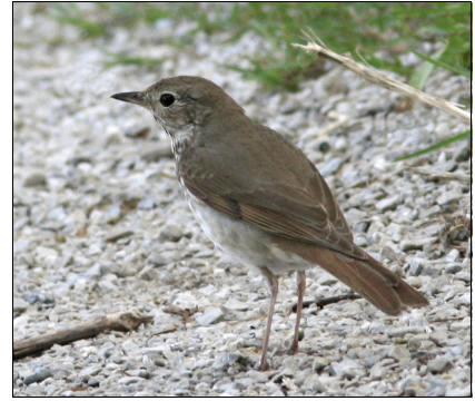
An apparent Bicknell's Thrush at the Tip on May 31, 2014