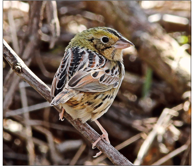
Henslow’s Sparrow at DeLaurier Parking Area on April 17-18, 2014