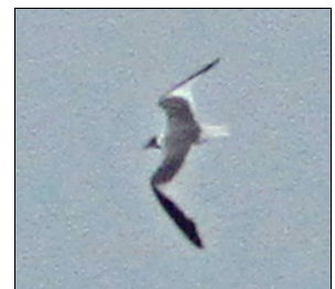
Adult Sabine's Gull at the Tip on September 1, 2014 — Blake A. Mann

September 4 — one juvenile, Tip (AW, MJN)