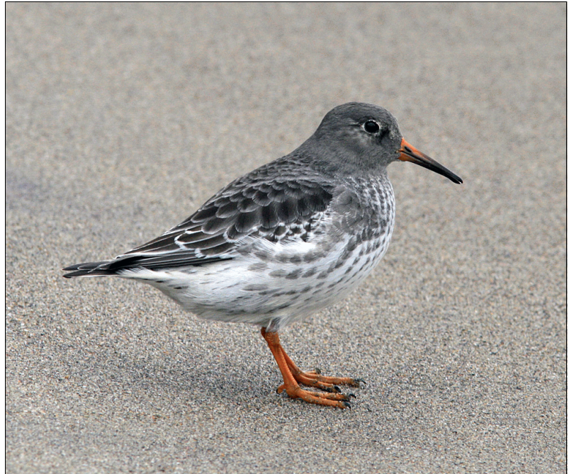
Juvenile Purple Sandpiper at the Tip on November 13, 2014 — Alan Wormington

November 17 — one, flying east to west past Tip, landed briefly (PDP)