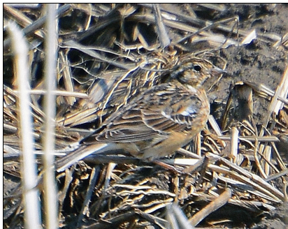
Female Smith's Longspur on May 3, 2014