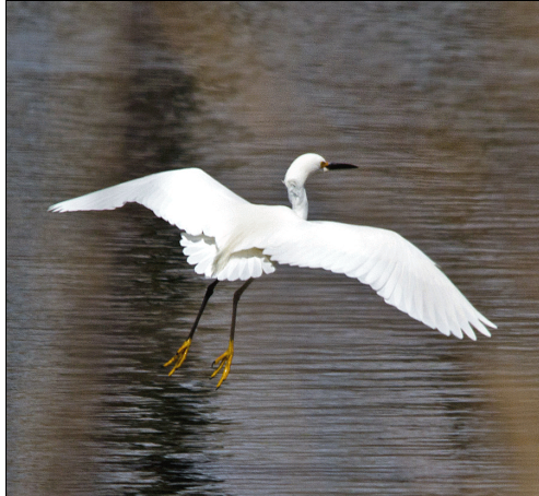
Adult Snowy Egret at NW Hillman Marsh on April 27, 2014