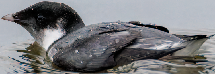
Ancient Murrelet, Burlington, Halton , 17 November 2023.