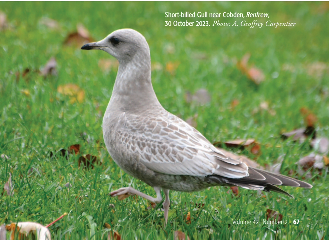
Short-billed Gull near Cobden, Renfrew, 30 October 2023.