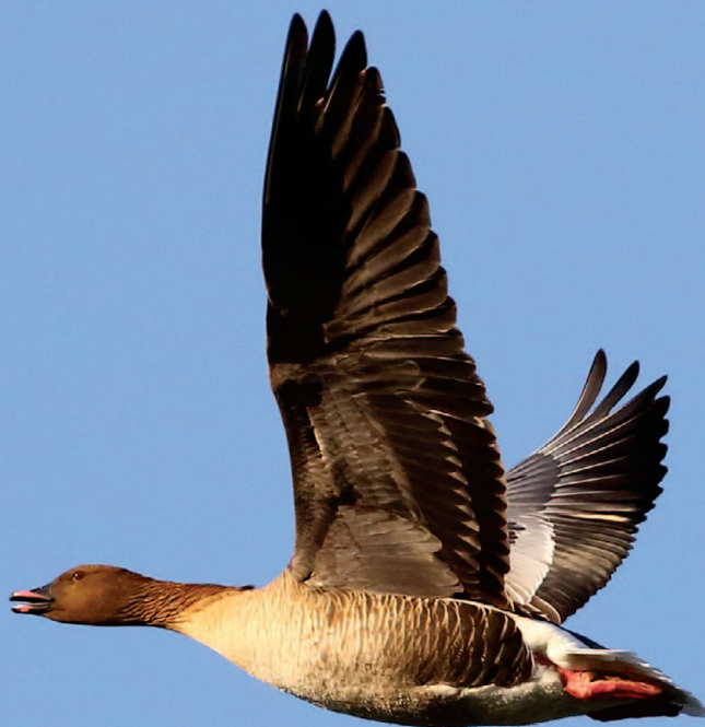
Pink-footed Goose, Reesor Pond, Durham County, 3 April 2023.