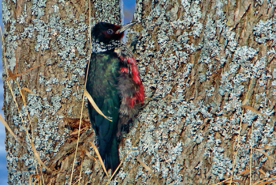
Lewis's Woodpecker, Tennent's Point, Manitoulin, 12 February 2023.