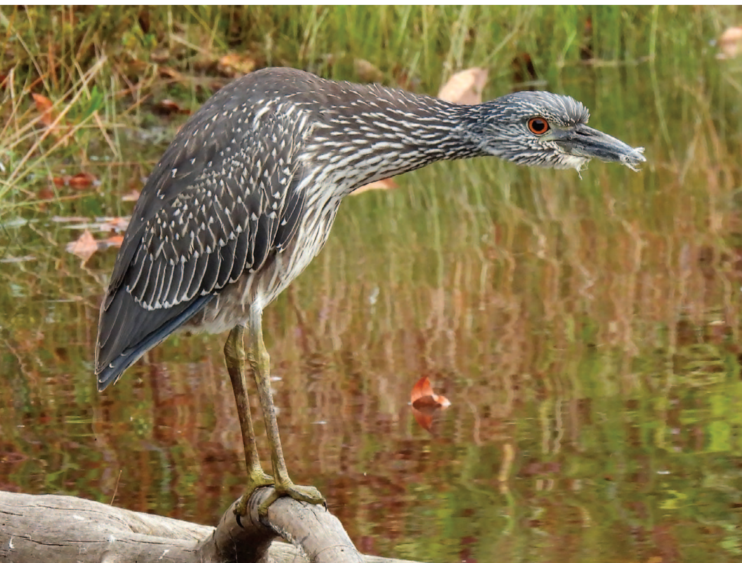
The long-staying Yellow-crowned Night Heron, Colonel Sam Smith Park, Toronto, Toronto, 5 October 2023.