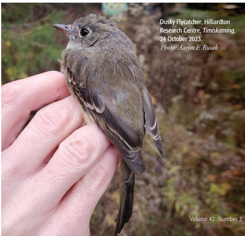
Dusky Flycatcher, Hilliardton Research Centre, Timiskaming , 24 October 2023.

2023 – one, definitive alternate, male, 3 June, Thunder Cape, Thunder Bay ( Asher N. Warkentin ; 2023-063) – photos on file.