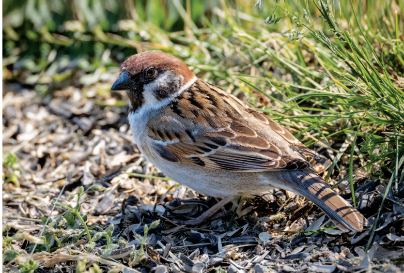
Eurasian Tree Sparrow, Gravelly Point, Prince Edward County, 30 May 2023.