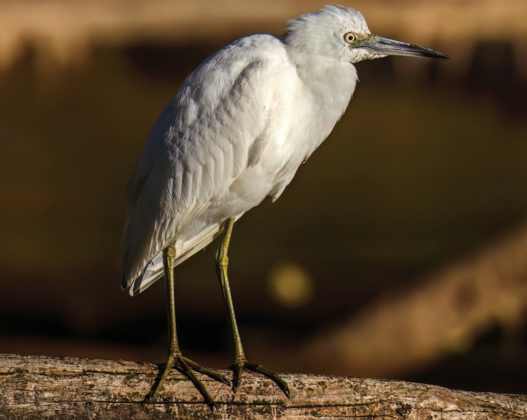
Little Blue Heron, Hamilton, Hamilton, 28 October 2023.