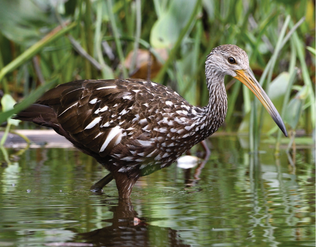
The long-awaited Limpkin was finally added to the Ontario list. This image shows the long-staying Haley Creek, Lanark County bird on 8 August 2023.