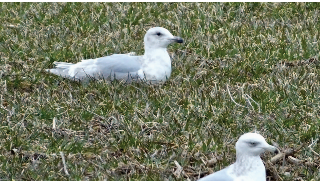
Glaucous-winged Gull, Ripley, Bruce, 1 April 2023.