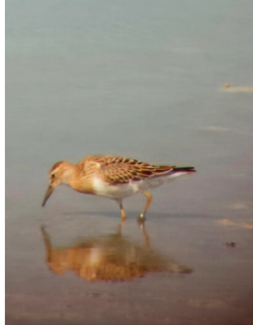
Figure 11. Upper right: Sharp-tailed Sandpiper at Exeter, Huron on 3 September 2017.