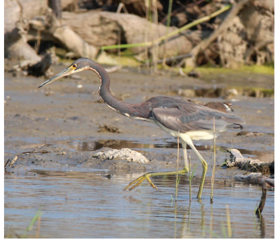
Figure 7. Tricolored Heron at Toronto (Tommy Thompson Park), Toronto on 21 July 2017.