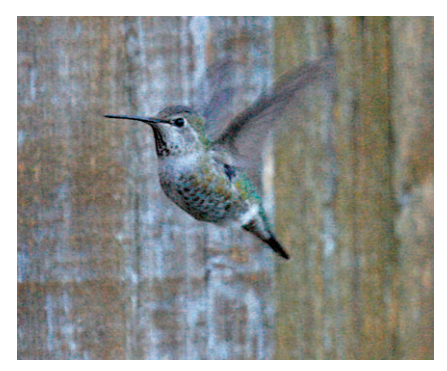
Figure 15. Anna's Hummingbird at Carleton Place. Lanark on 10 November 2017.

A close runner-up for bird of the year! Just the third provincial record, this was the first individual that was accessible to southern Ontario birders. As such. hundreds of individuals were able to enjoy this bird during its stay.