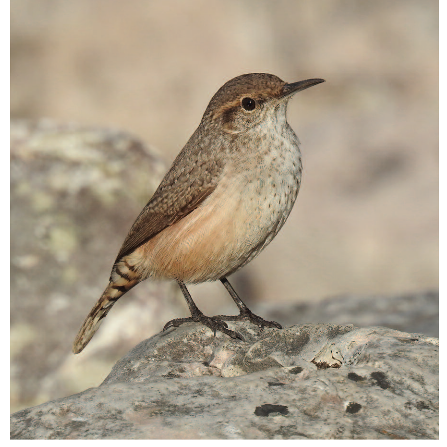
Figure 19. Rock Wren at Boulder Beach, Bruce on 8 October 2017.