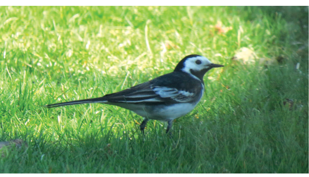
Figure 20. White Wagtail of the subspecies yarellii ("Pied Wagtail") at Port Colborne, Niagara on 16 April 2017.

2017 – one, first basic male, 29 November-19 December, Oakville, Halton (Cheryl E. Edgecombe, Dominik Halas; 2017-007) – photos on file.