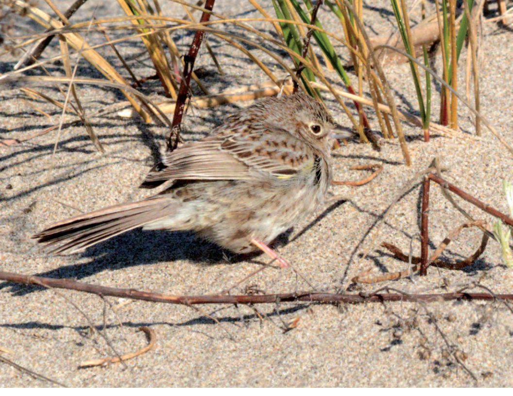
Figure 22. Cassin's Sparrow at Long Point (Tip), Norfolk on 24 April 2017.