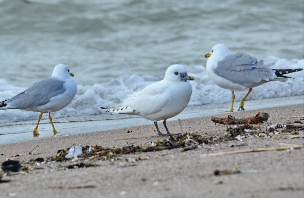
Figure 13. Ivory Gull with Ring-billed Gulls ( Larus delawarensis ) at Colchester, Essex on 3 March 2017.