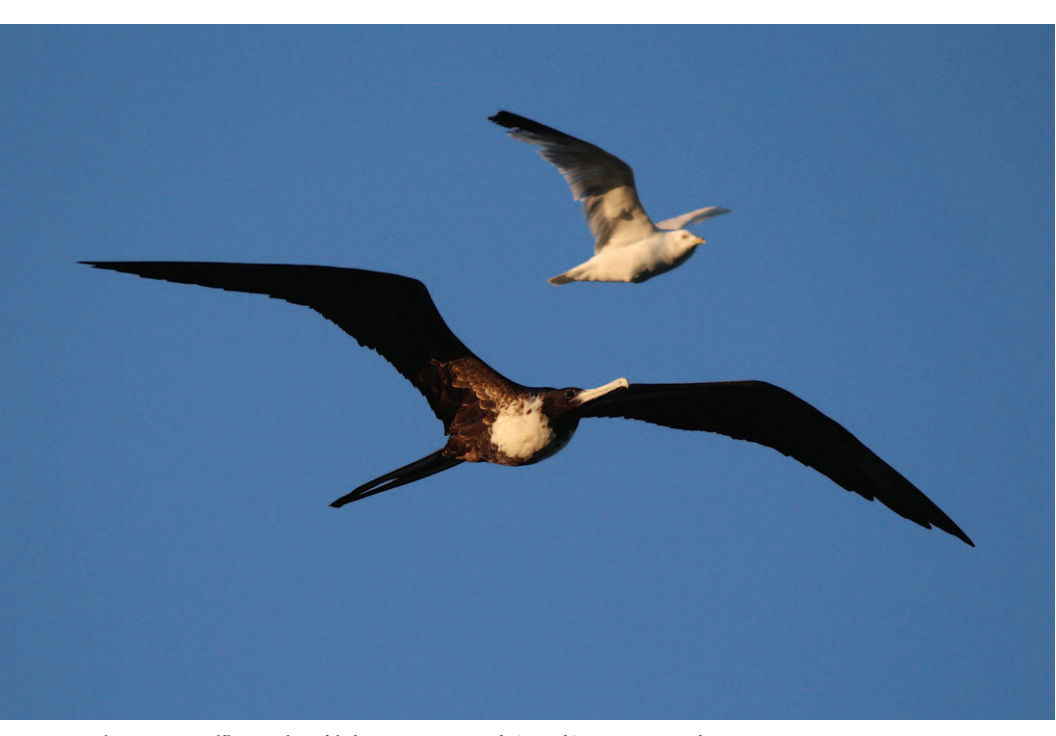
Figure 6. Magnificent Frigatebird at Sturgeon Creek (mouth), Essex on 2 July 2017.