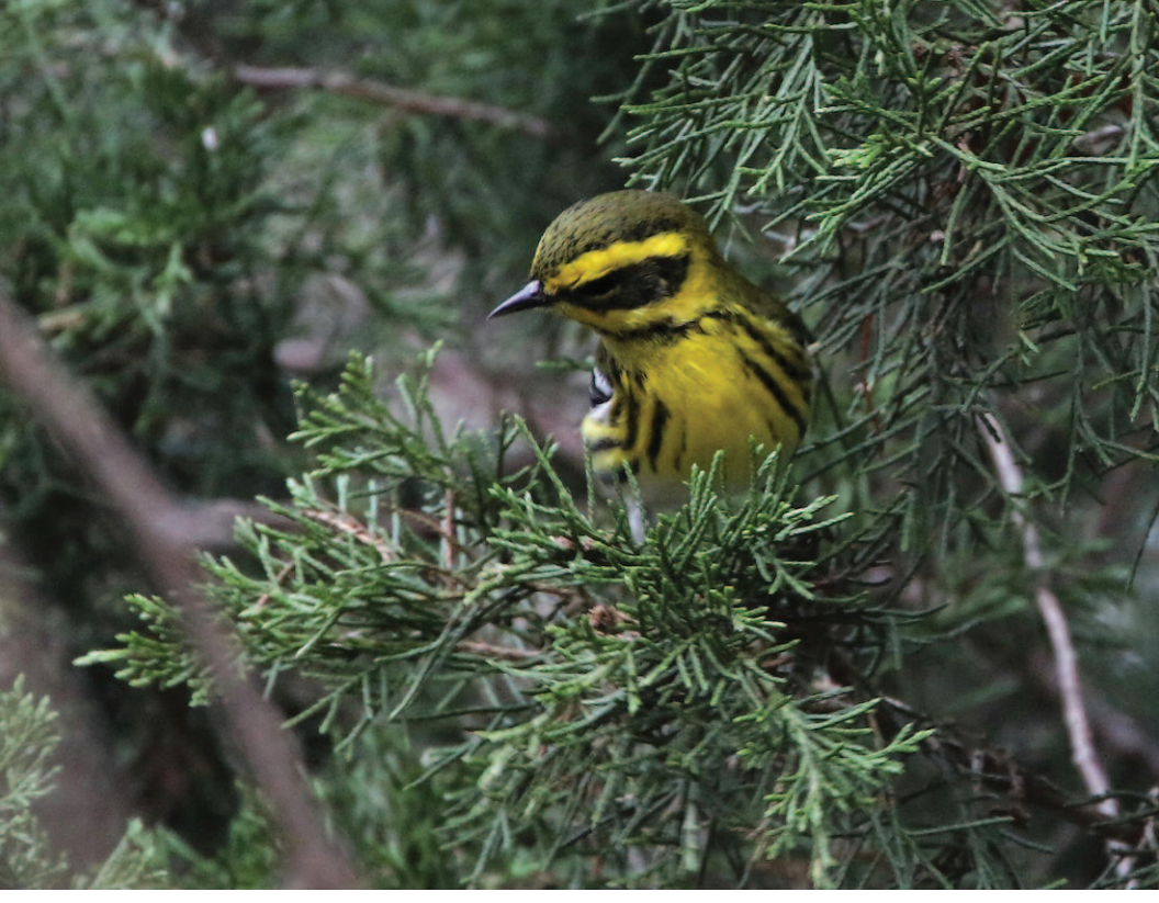
Figure 21. Townsend's Warbler at Rondeau Park, Chatham-Kent on 22 November 2017.