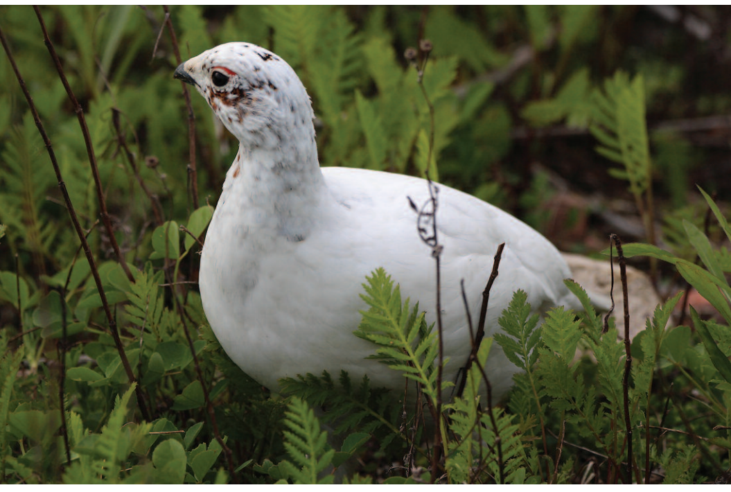
Figure 4. Willow Ptarmigan at Toronto (Tommy Thompson Park), Toronto on 13 May 2017.