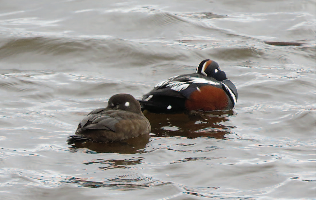
Figure 3. Harlequin Ducks at Connaught, Cochrane on 28 April 2017.