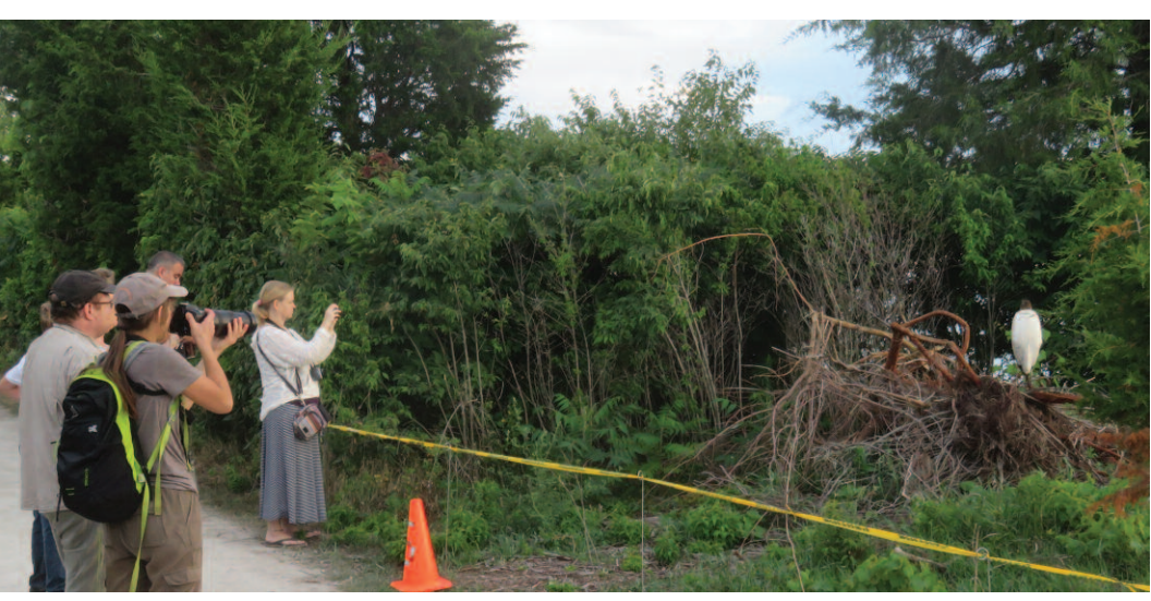
Figure 5. Birders enjoying the incredibly tame Wood Stork at Point Pelee National Park, Essex on 12 August 2017.