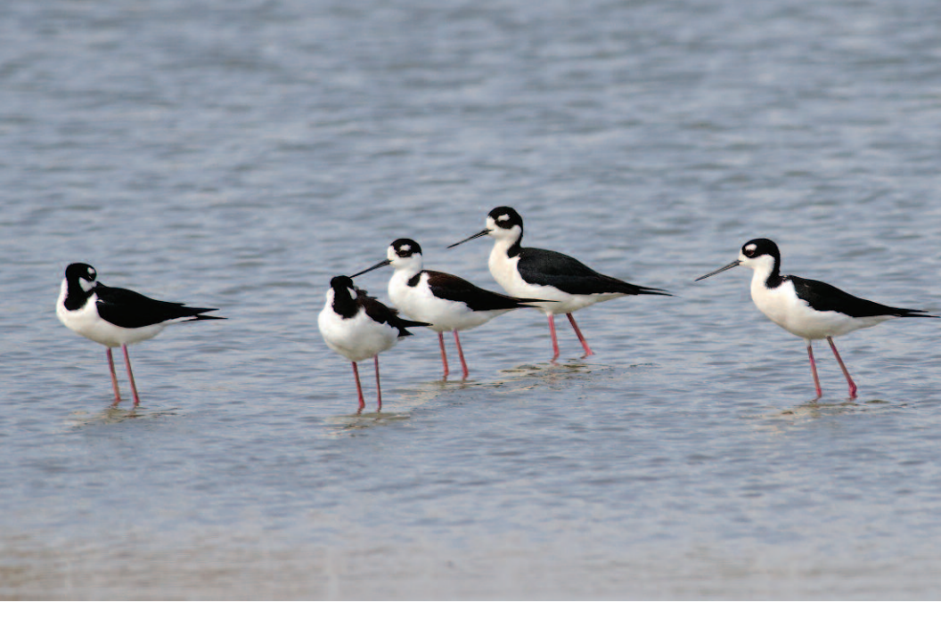
Figure 10. Black-necked Stilts at Windsor, Essex on 15 April 2017.