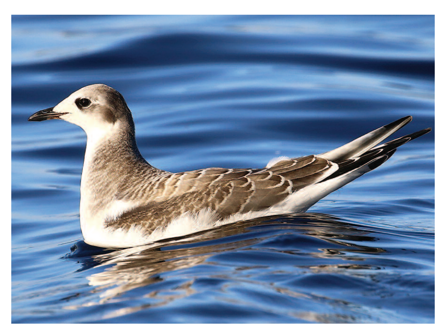
Figure 14. Sabine's Gull at Bedivere Lake, Thunder Bay on 22 September 2017.