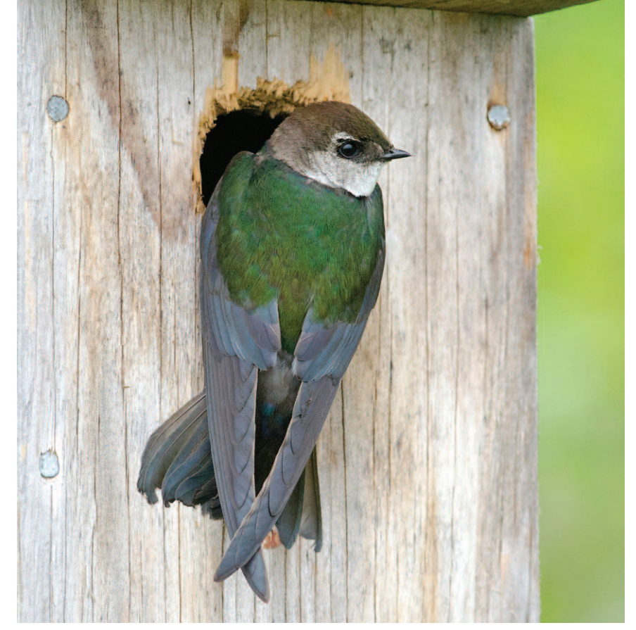
Figure 18. Violet-green Swallow at Thunder Bay, Thunder Bay on 14 June 2017.