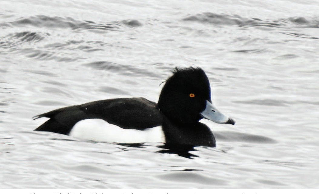
Figure 2. Tufted Duck at Mississauga, Peel on 17 December 2017.