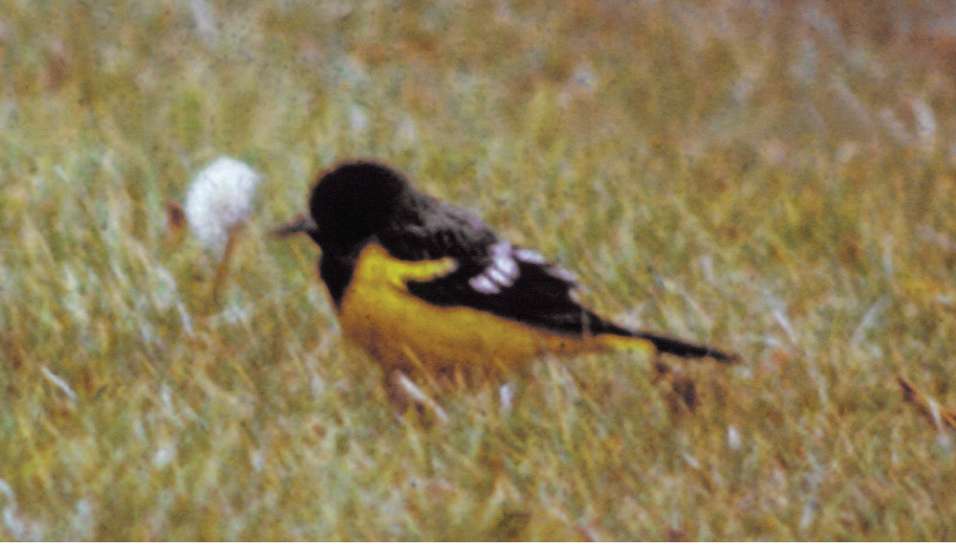
Figure 23. Scott's Oriole at Silver Islet, Thunder Bay on 9 November 1975.