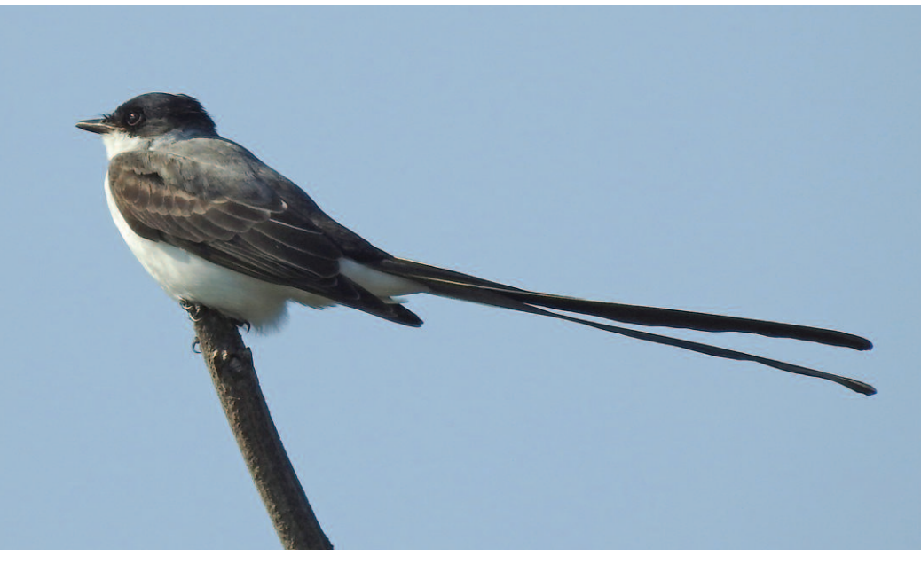
Figure 17. Fork-tailed Flycatcher at Toronto (Tommy Thompson Park), Toronto on 24 September 2017.