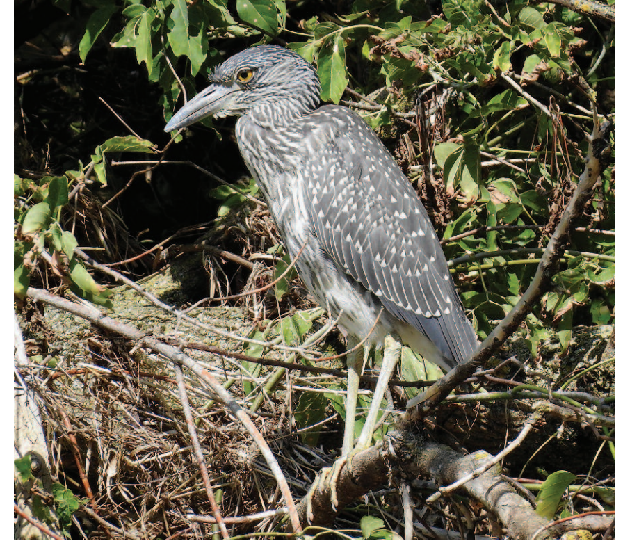
Figure 8. Yellow-crowned Night-Heron at St. Jacobs, Waterloo on 2 September 2017.