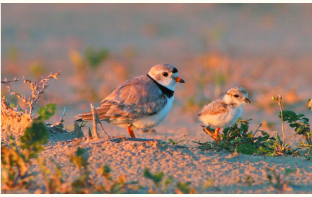
Figure 9: Definitive alternate Piping Plover at Oliphant, Bruce, from 5 June - 21 July 2008.