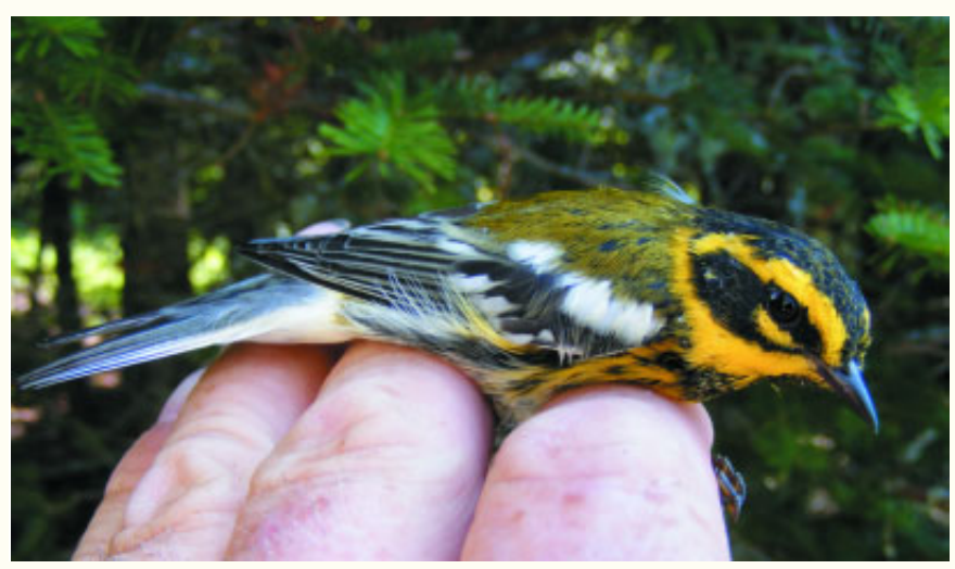
Figure 16: Definitive alternate male Townsend's Warbler at Thunder Cape, Thunder Bay, on 3 August 2008.

Two birds were present at the same time at Point Pelee National Park in May 2005. Numerous photographs were obtained of the two, but for the majority of photos, the Committee was unable to assign them to a specific individual: thus one of the birds remains undocumented