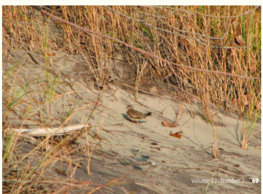
Figure 11: Juvenile Common Ground-Dove at Long Point (Squires Ridge), Norfolk , on 1 November 2008.

This record is only the third for the province, and the first for the south. The two previous records were on 29 October 1968 at Red Rock, Thunder Bay (Wormington 1987) and 14 August 2002 at Thunder Cape, Thunder Bay (Crins 2003).