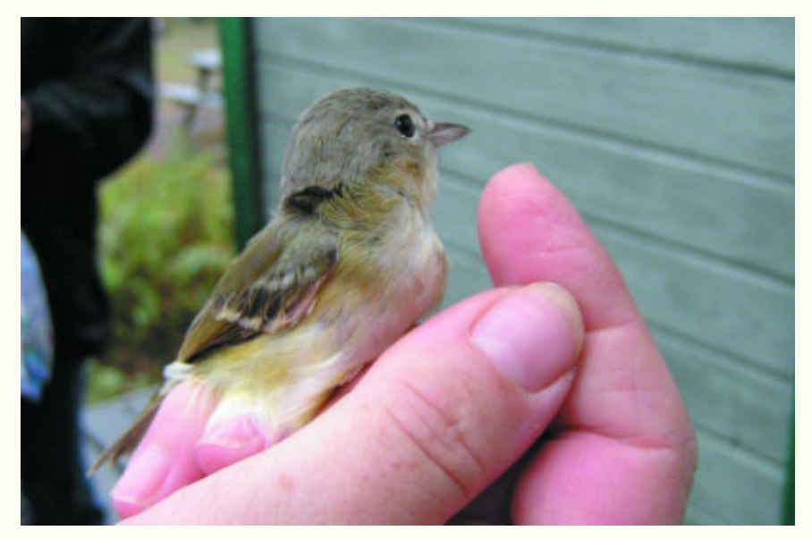
Figure 15: First basic Bell's Vireo, at Thunder Cape, Thunder Bay , on 7 September 2007.

A second bird joined the Parry Sound bird in January 2009, also remaining until late March.