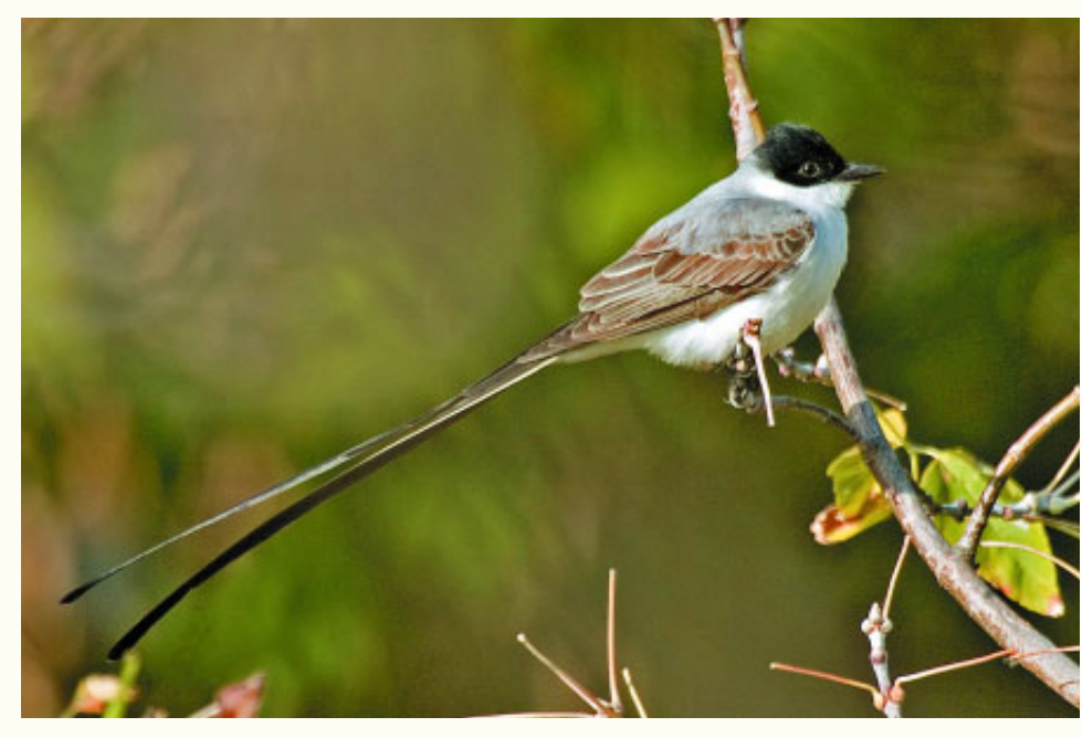
Figure 14: Fork-tailed Flycatcher north of Point Pelee National Park, Essex, on 22 October 2008.