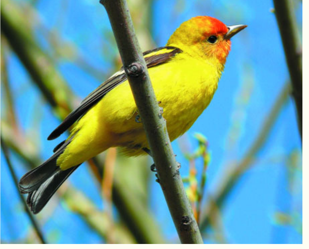
Figure 17: Alternate male Western Tanager at Sault Ste. Marie, Algoma, from 7-8 May 2008.