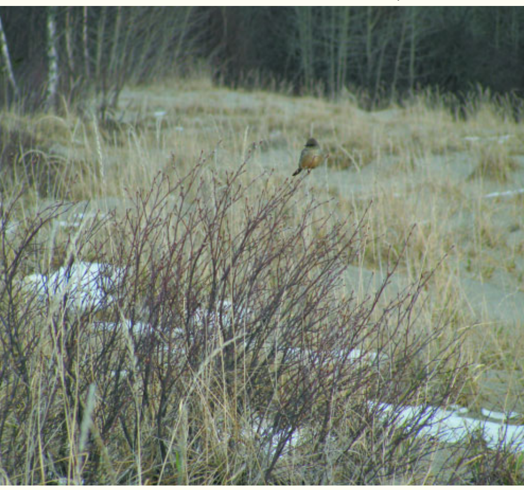
Figure 13: Say's Phoebe at Terrace Bay, Thunder Bay, on 28 April 2008.

This is the first record for northern Ontario, and represents the most northerly occurrence of the species in North America.