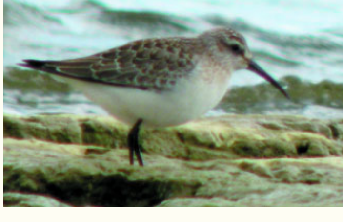
Figure 10: Curlew Sandpiper in juvenal plumage at Fort Erie, Niagara, from 28 September – 14 October 2008.