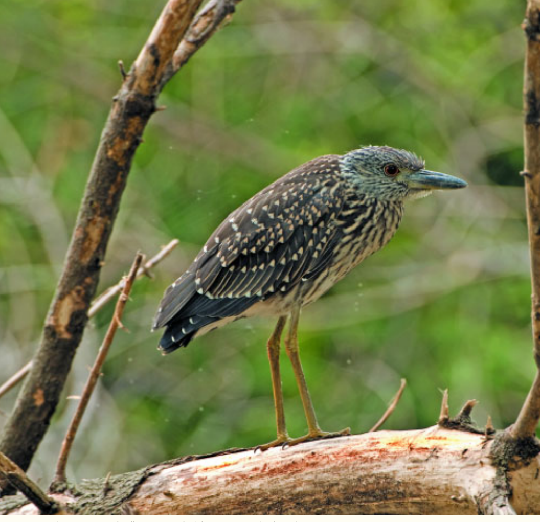
Figure 6: Juvenal Yellow-crowned Night-Heron at Grimsby, Niagara , on 24 August 2008.