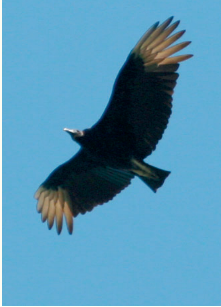
(right) Figure 7: Definitive basic Black Vulture on 22 June 2008 at Tobermory, Bruce.