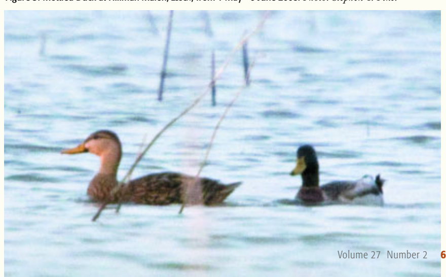
Figure 3: Mottled Duck at Hillman Marsh, Essex, from 1 May - 6 June 2008.

The Committee considered the possibility that this individual, the first for the province, came from one of the established, introduced populations, such as the east coast (South Carolina) or Oklahoma. However, there was no evidence to suggest this to be the case. In addition, there is a well established pattern of vagrancy of birds from the species native range (Texas and the Gulf coast) into the mid- and upper Mississippi Valley (states such as lowa, Indiana, Illinois, Missouri and North Dakota). Furthermore, the introduced populations have been in place since the 1970s to early 1980s, so even if the bird was from these areas, it would still be considered a wild bird from an established population.