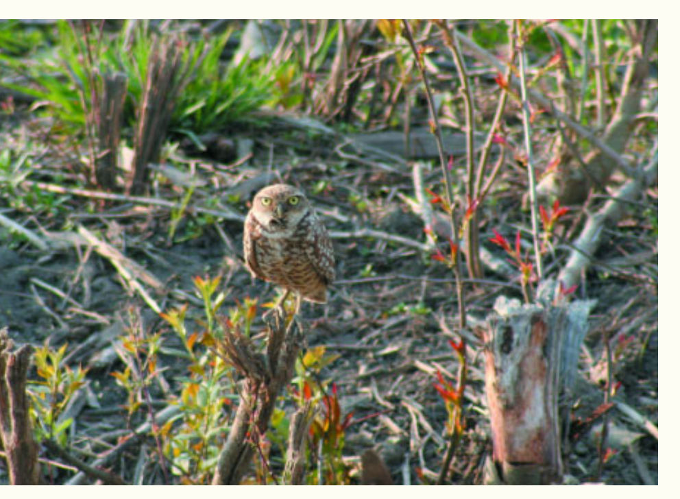
Figure 12: Burrowing Owl, at Pelee Island, Essex, on 25 April 2008.