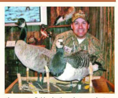
Figure 2: Definitive basic male Barnacle Goose, Baie Des Atocas, Prescott and Russell, circa 20 November 2005.

2005 - one, definitive basic, male, circa 20 November, Baie Des Atocas, Prescott and Russell (<u>Jean Buswell</u>, also found by Henri Poupart, Jean-Claude Bermond; 2008-051) - photo on file; specimen (mount) in private collection of Jean Buswell.