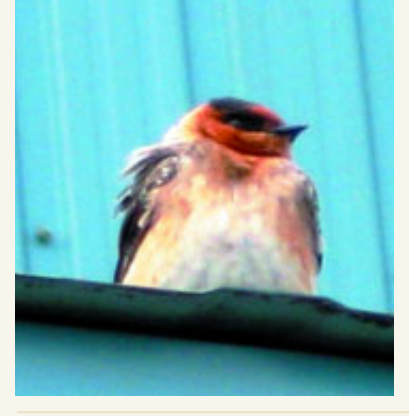
Figure 14. Cave Swallow at Erieau, Chatham-Kent, on 7 November 2007.

Hummingbird species Selasphorus sp. (8) 2007 one female or first basic male, 15 July, Elk Lake, Timiskaming (Michael Werner, found by Lionel Venne; 2007-134).