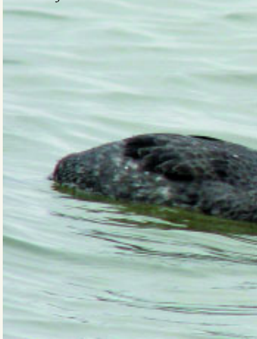
Figure 2. Western Grebe at Bronte, Halton, from 5-9 April 2007.