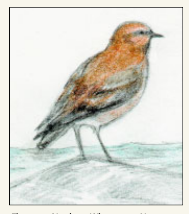
Figure 15. Northern Wheatear at Nepean, Ottawa, on 19 October 2006.