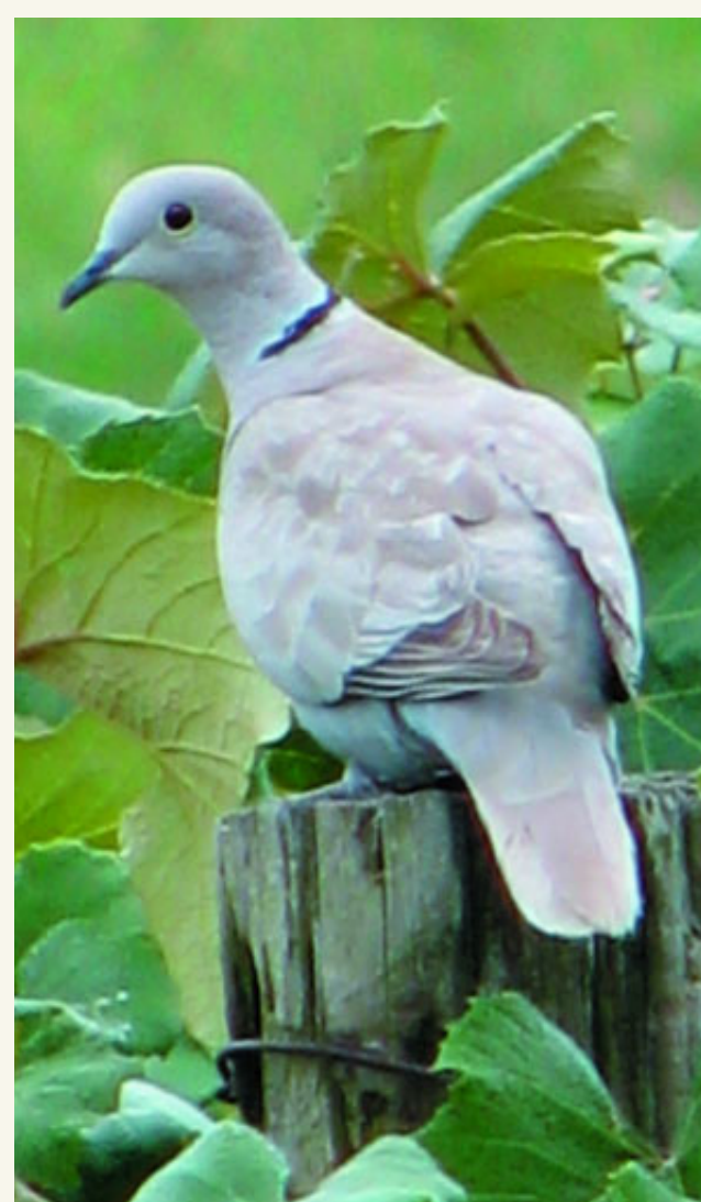
Figure 10. Male Eurasian Collared-Dove at Vinemount, Hamilton, from 17 July – 1 September 2007.