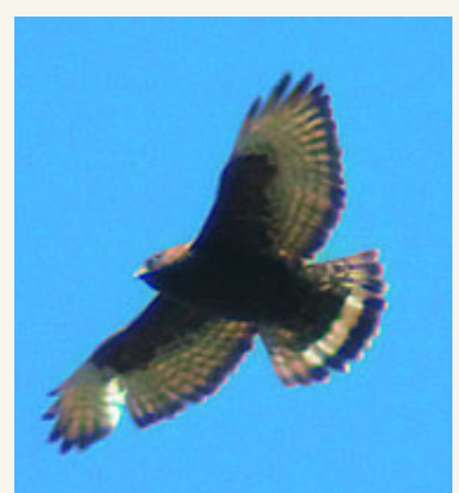
Figure 5. First basic "dark morph" Broadwinged Hawk at Grimsby, Niagara , on 24 April 2007.