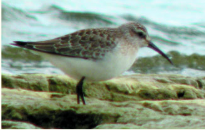
Figure 10: Curlew Sandpiper in juvenal plumage at Fort Erie, Niagara , from 28 September – 14 October 2008.