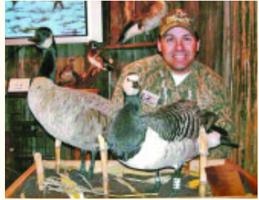
Figure 2: Definitive basic male Barnacle Goose, Baie Des Atocas, Prescott and Russell , circa 20 November 2005.

2005 – one, definitive basic, male, circa 20 November, Baie Des Atocas, Prescott and Russell (Jean Buswell, also found by Henri Poupart, Jean-Claude Bermond; 2008-051) – photo on file; specimen (mount) in private collection of Jean Buswell.