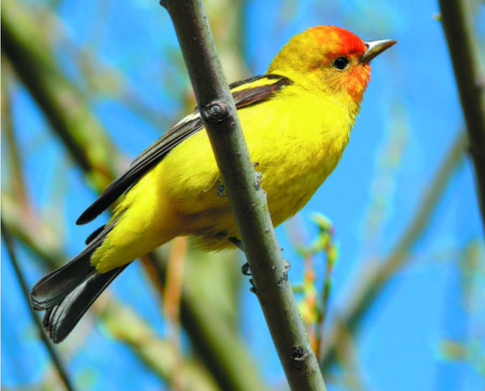
Figure 17: Alternate male Western Tanager at Sault Ste. Marie, Algoma , from 7-8 May 2008.