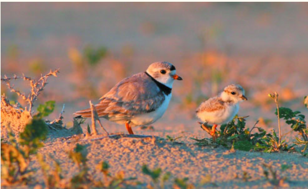
Figure 9: Definitive alternate Piping Plover at Oliphant, Bruce , from 5 June - 21 July 2008.