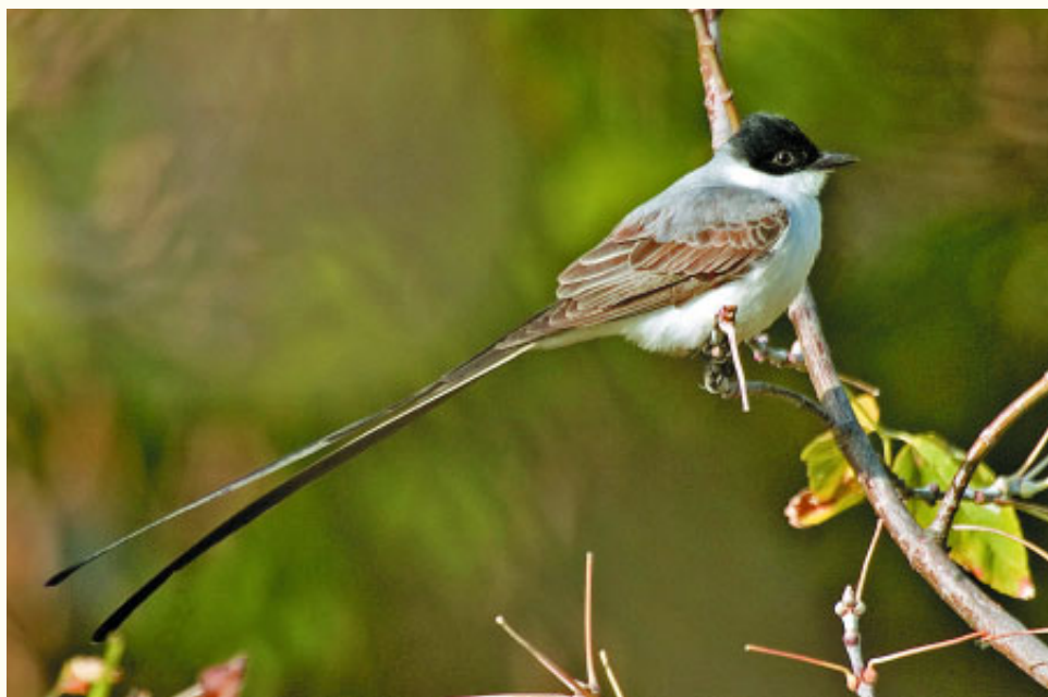
Figure 14: Fork-tailed Flycatcher north of Point Pelee National Park, Essex , on 22 October 2008.