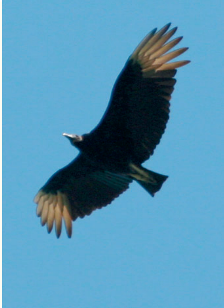
(right) Figure 7: Definitive basic Black Vulture on 22 June 2008 at Tobermory, Bruce .