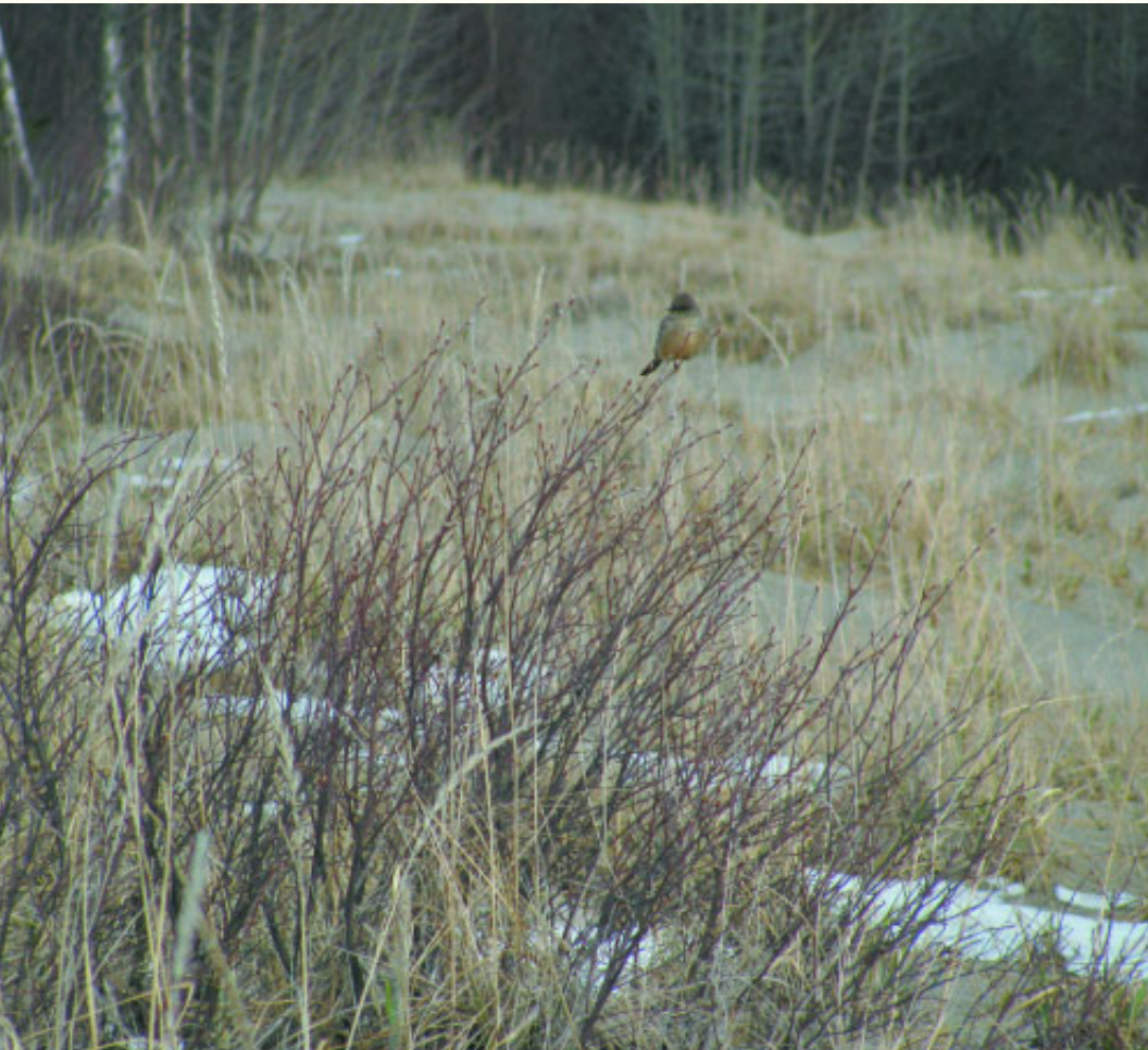
Figure 13: Say's Phoebe at Terrace Bay, Thunder Bay, on 28 April 2008.

This is the first record for northern Ontario, and represents the most northerly occurrence of the species in North America.