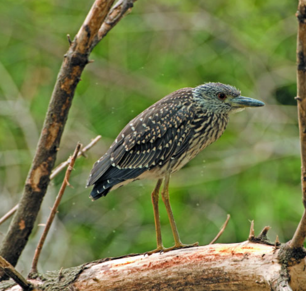
Figure 6: Juvenile Yellow-crowned Night-Heron at Grimsby, Niagara , on 24 August 2008.