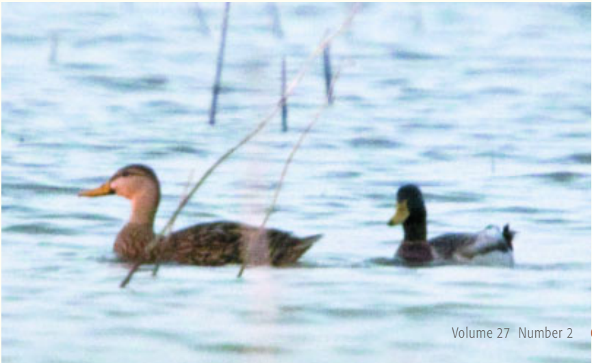
Figure 3: Mottled Duck at Hillman Marsh, Essex, from 1 May - 6 June 2008.

The Committee considered the possibility that this individual, the first for the province, came from one of the established, introduced populations, such as the east coast (South Carolina) or Oklahoma. However, there was no evidence to suggest this to be the case. In addition, there is a well established pattern of vagrancy of birds from the species native range (Texas and the Gulf coast) into the mid- and upper Mississippi Valley (states such as Iowa, Indiana, Illinois, Missouri and North Dakota). Furthermore, the introduced populations have been in place since the 1970s to early 1980s, so even if the bird was from these areas, it would still be considered a wild bird from an established population.