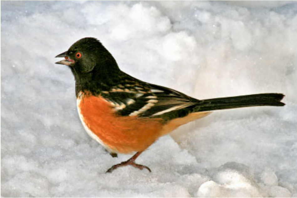
Figure 18: Spotted Towhee at Point Pelee National Park, Essex, from 11 November 2008 - 26 March 2009.