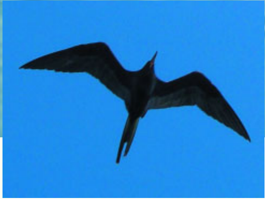
Figure 5: Basic male frigatebird species seen at Colchester, Essex, on 12 October 2008.