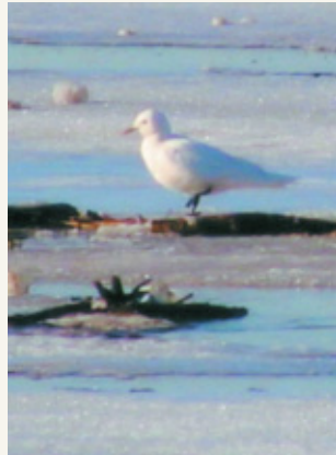
Figure 8: Definitive basic Ivory Gull at Pembroke, Renfrew , on 28 March 2006.

An article on the Hillman Marsh/Wheatley Harbour record has been published (Hall and Hall 2006). The Pembroke bird represents one of the few records of Ivory Gull in definitive basic plumage in southern Ontario (Alan Wormington, pers. comm.).