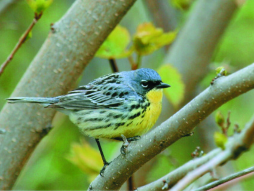
Figure 12: Definitive alternate male Kirtland's Warbler at Point Pelee National Park, Essex , on 21 May 2006.

2006 one definitive alternate, male, 21 May, Point Pelee National Park, Essex ( Alan Wormington , Rosalee A. Hall; 06-120) – photos on file.