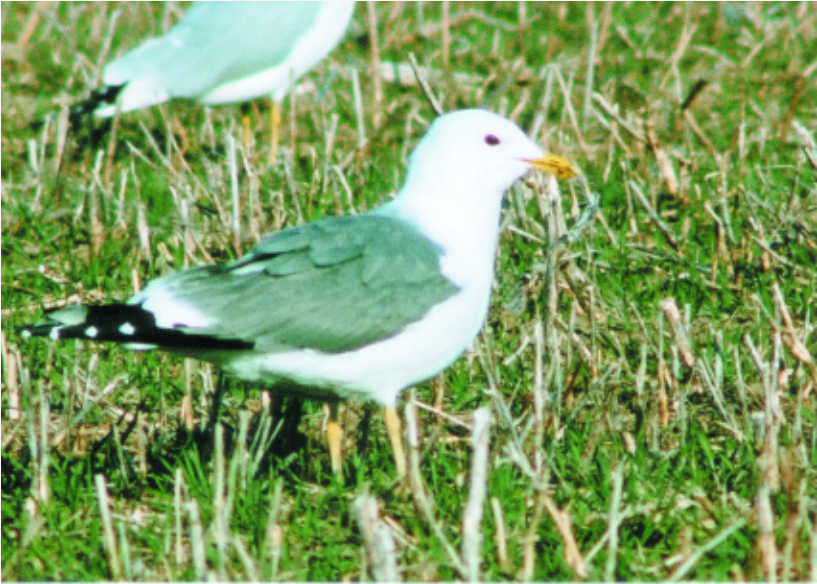
Figure 6: Mew Gull in definitive alternate plumage at Wheatley Harbour, Essex , on 31 March 2006.

2006 one definitive alternate, L. c. brachyrhynchus , 31 March, Wheatley Harbour, Essex ( Alan Wormington ; 06-037) – photos on file.