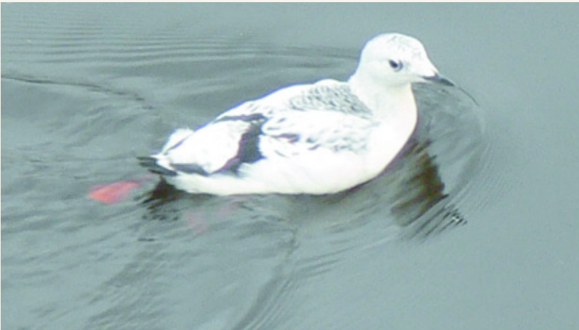
Figure 9: First basic Black Guillemot at Massey, Sudbury , from 14 to 21 November 2006.

This bird is considered to be of the eastern Arctic subspecies ultimus because of its extreme whiteness (R. J. Pittaway and J. Iron, pers. comm.). This is the subspecies that breeds along the coasts and islands of Hudson Bay; it is known to have bred once in Ontario, on Manchuinagush Island, Polar Bear Provincial Park, Kenora (James 1987, 1991). Pittaway (2007) wrote a brief account of this record, including its possible demise at the hands of a Bald Eagle.