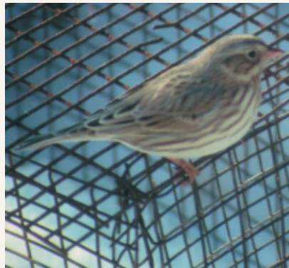
Figure 14: First basic “Ipswich” Savannah Sparrow at Port Stanley, Elgin, from 17 to 27 December 2005.