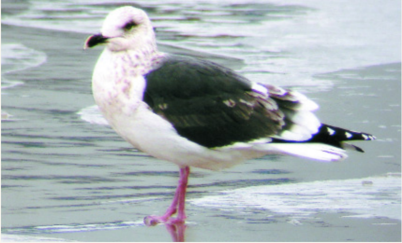
Figure 7: Third basic Slaty-backed Gull at Wheatley Harbour, Essex , from 22 to 26 January 2006.

This third basic bird was well documented, with excellent photographs. A brief account of this record has been published (Anonymous 2006). The two previous records involved definitive basic birds in Niagara Falls, Niagara , from 24 November to 29 December 1992 (Bain 1993), and in Toronto, Toronto , from 2-9 January 1999 (Roy 2000).