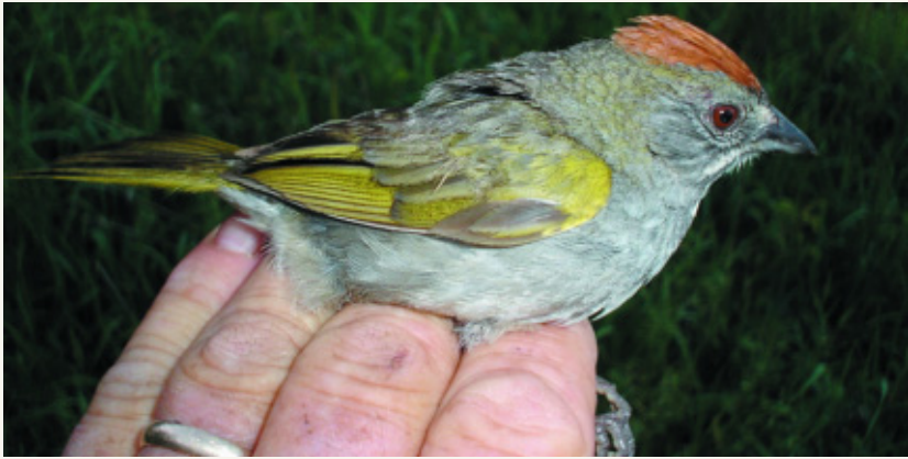
Figure 13: Definitive basic male Green-tailed Towhee at Thunder Cape, Thunder Bay , on 10 June 2006.

This bird was banded at Thunder Cape, and its band number subsequently was read at a feeder at Mountain Lake, Cottonwood Co., Minnesota, in November 2006, where it remained until at least March 2007 (Alan Wormington, pers. comm.). The distance between these two locations is approximately 700 km. This is the first record of this species in northern Ontario, and the first in the province since 1986 (Wormington 1987).