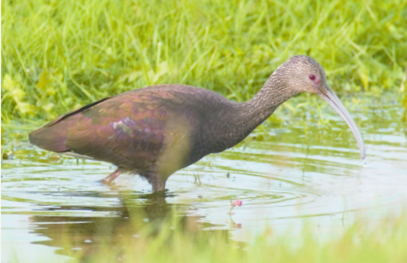
Figure 4: White-faced Ibis in definitive prebasic molt at Erie View, Norfolk , from 2 to 3 October 2006.

This bird was a member of a flock of 11 dark ibises that appeared in Erie View, Norfolk , on 2 October 2006. This is the latest record of a White-faced Ibis in Ontario.