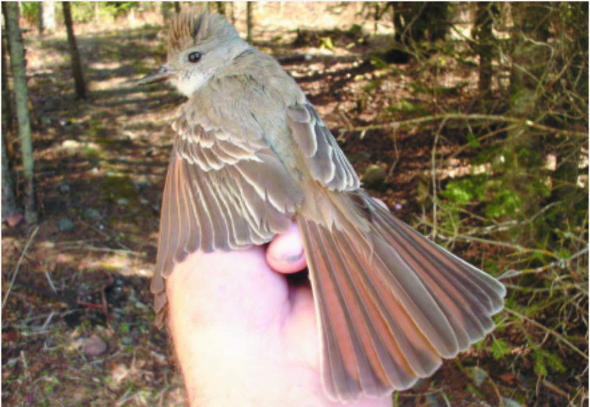
Figure 10: Alternate Ash-throated Flycatcher at Thunder Cape, Thunder Bay, on 26 April 2006.