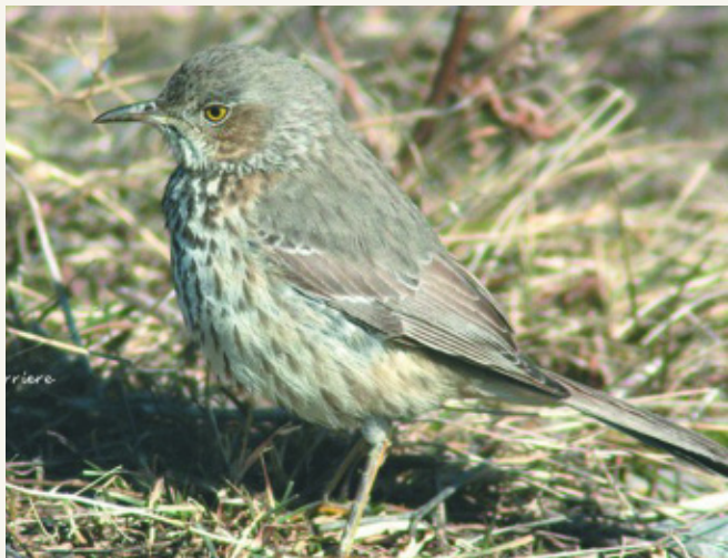
Figure 11: Sage Thrasher at Port Weller, Niagara, from 24 to 27 February 2006.

This is the first winter record for the province.