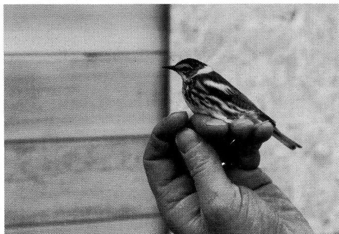
Cape May Warbler banded at TCBO

Throughout my stay the weather and birds gradually got better and though I missed good birds in southern Ontario (e.g. the Pelee Kirtland's Warbler), I did get to see some interesting birds at TCBO, such as a Double-crested Cormorant with white crests, suggesting the western form. The rare passerine of my stay finally turned up outside the cabin window on May 27. Through the drizzle I could see that the Carpodacus finch perched near the top of one of the balsam firs had a plain face and I groaned, realizing that I would have to make detailed notes for this rarity. True, this was one of