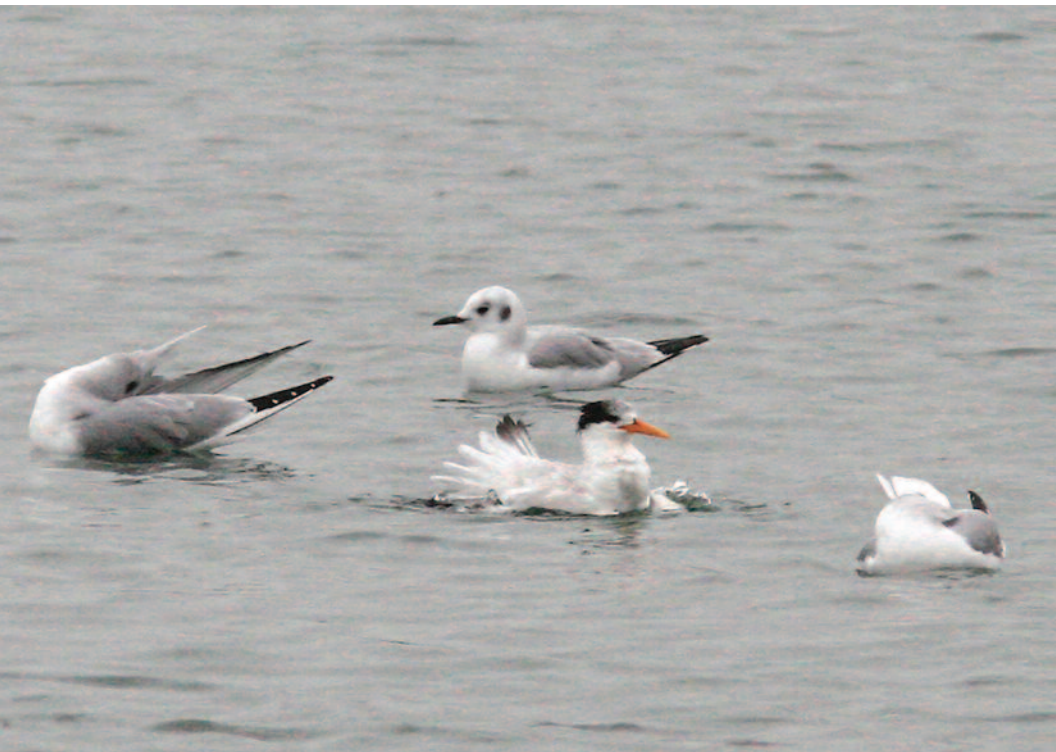
Figure 3. Elegant Tern bathing in Black Rock Canal, Squaw Island Park, Buffalo, NY, on 22 November 2013.