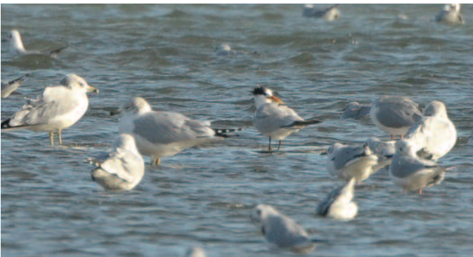
Figure 1. Elegant Tern first found off Beaver Island State Park, Grand Island, NY, on 20 November 2013.