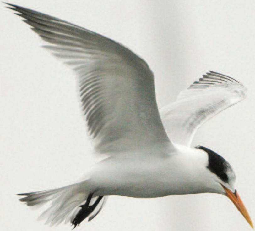
Figure 4. Elegant Tern over Black Rock Canal from Squaw Island Park, Buffalo, NY, on 21 November 2013.