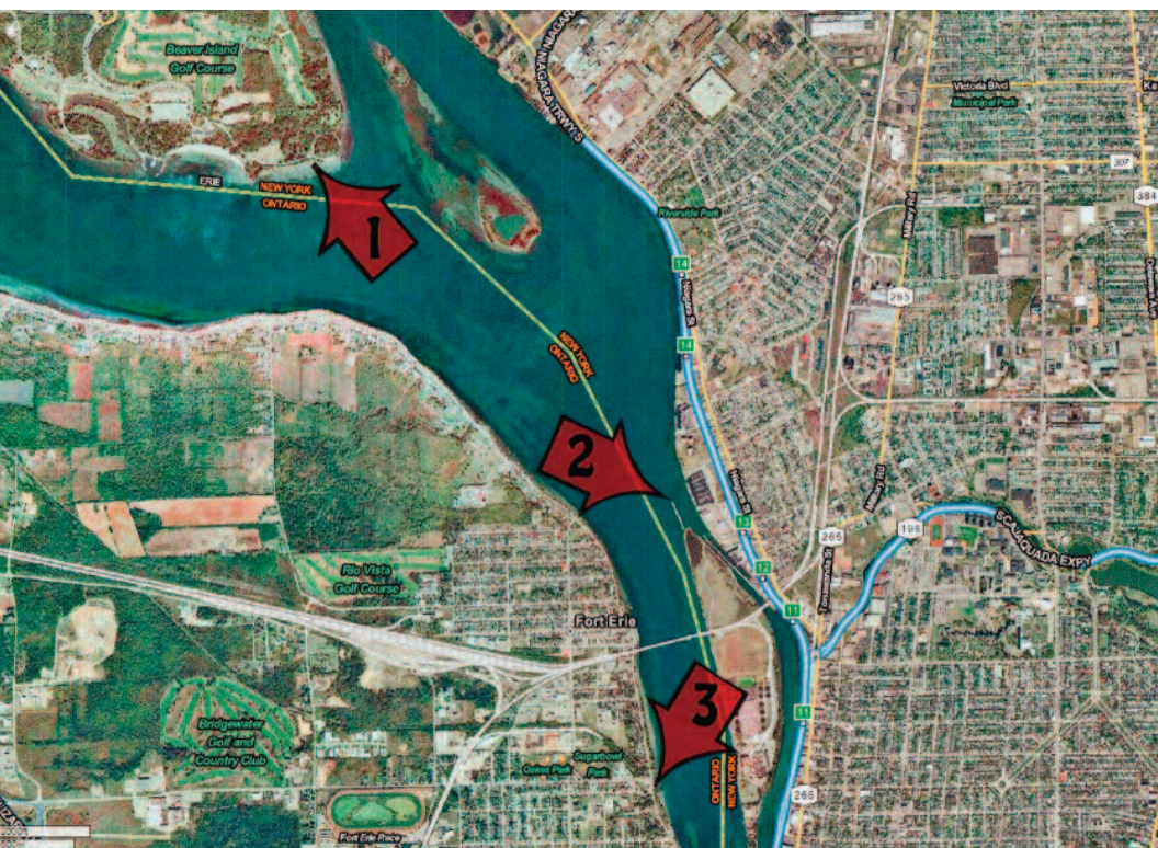
Figure 8. Map of Niagara River along the United States-Canada border at Buffalo, NY, and Fort Erie, ON.

Red Arrow 1: Beaver Island State Park at the southern tip of Grand Island where the Elegant Tern was initially found on 20 November 2013.