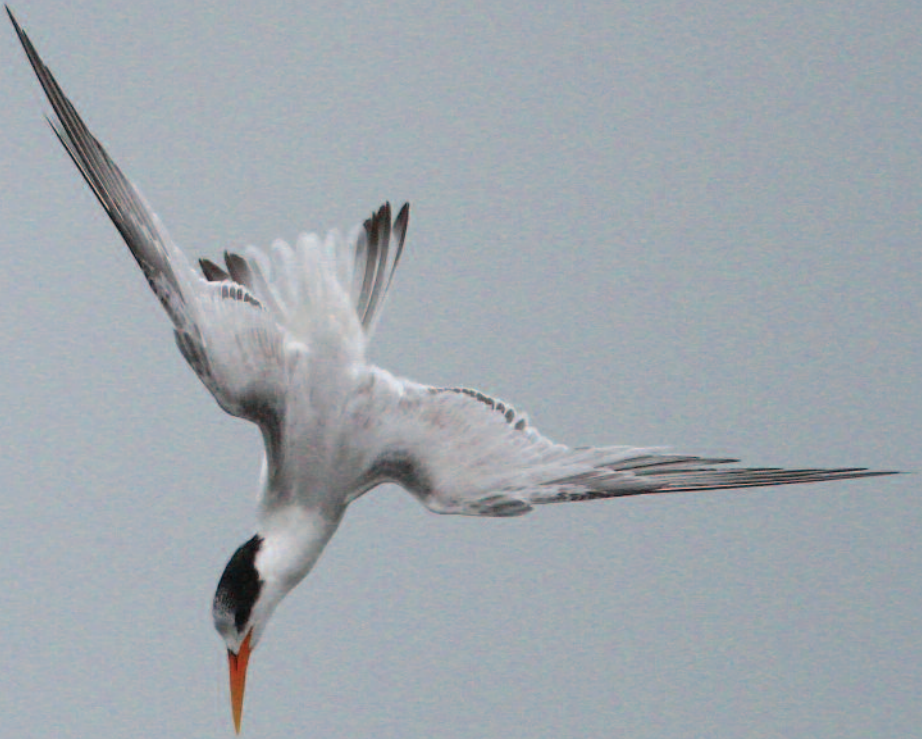
Figure 14. Elegant Tern plunge-diving over Black Rock Canal from Squaw Island Park, Buffalo, NY, on 22 November 2013.

more unbelievable is the fact that this particular individual accomplished this feat in only six to eight months after hatching. Foraging depends on location and season, and varies from offshore to nearshore in shallow lagoons and harbours. Migrant birds generally feed in harbours, estuaries, salt-ponds and lagoons while non-breeders commonly feed in lagoons and bays avoiding rough waters (del Hoyo et al. 1996). Its main food is schools of fish of five species and, very rarely, crustaceans (Shaffner 1986).