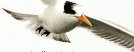
Figure 16. Elegant Tern over Black Rock Canal from Squaw Island Park, Buffalo, NY, on 22 November 2013.

It is of interest to note that in addition to the above sightings away from the Pacific coast, the Elegant Tern has been recorded several times in the Old World. Vagrants are reported in Europe from Belgium, Denmark, England, Germany, France, the Netherlands, Northern Ireland, Portugal and Spain (AOU 1998, Burness et al. 1999, Kwater 2001, Shoch and Howell 2013). In addition, one or more Elegant Terns have bred with 'Eurasian' Sandwich Terns in France from 1974 to 1985 (Olsen and Larsson 1995). Two additional records are also known from South Africa and Argentina (Kwater 2001).