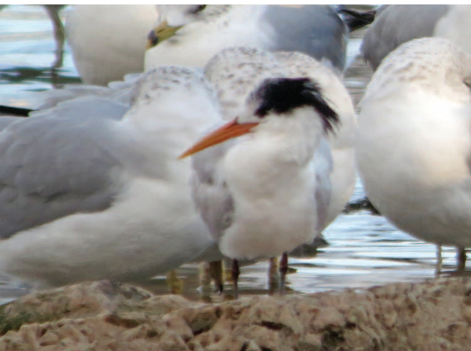
Figure 11. Elegant Tern with Ring-billed Gulls on rocky outcrop of Niagara River shoreline, Fort Erie, ON, on 24 November 2013. Note long shaggy black crest.

At 1535h, Luc Fazio, along with his son Xavier, re-located the bird after it unexpectedly returned to the exact rocky outcrop where it had been seen earlier that afternoon (Figure 10). With the tern only 25-30 meters distant, some 15-20 lucky birders were able to study the bird's plumage and structure in detail as it stood in Ontario (Figure 11).