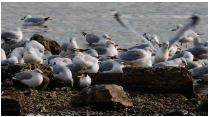
Figure 9. Elegant Tern at bottom foreground on rocky outcrop of Niagara River shoreline, Fort Erie, ON, on 24 November 2013.

The news spread quickly with an immediate alert forwarded to ONT-BIRDS, the Ontario Field Ornithologists internet birding listserv, while texts and cellular calls were made to many birders. Unfortunately, the tern remained for only some 10-12 minutes before flying off the point with numerous gulls (Dave Fidler, pers. comm.).