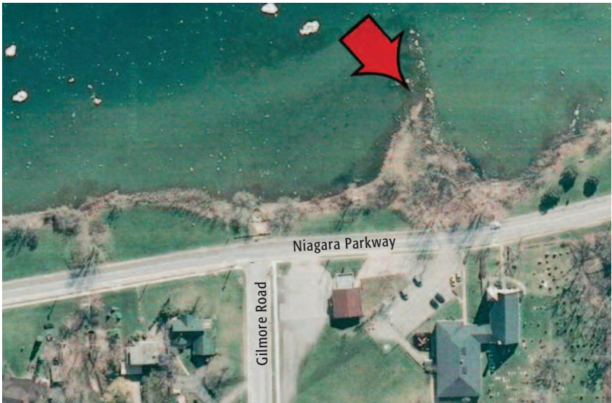
Figure 10. The red arrow pinpoints the rocky outcrop shoreline location in Fort Erie, ON, where the Elegant Tern was observed on 24 November 2013.