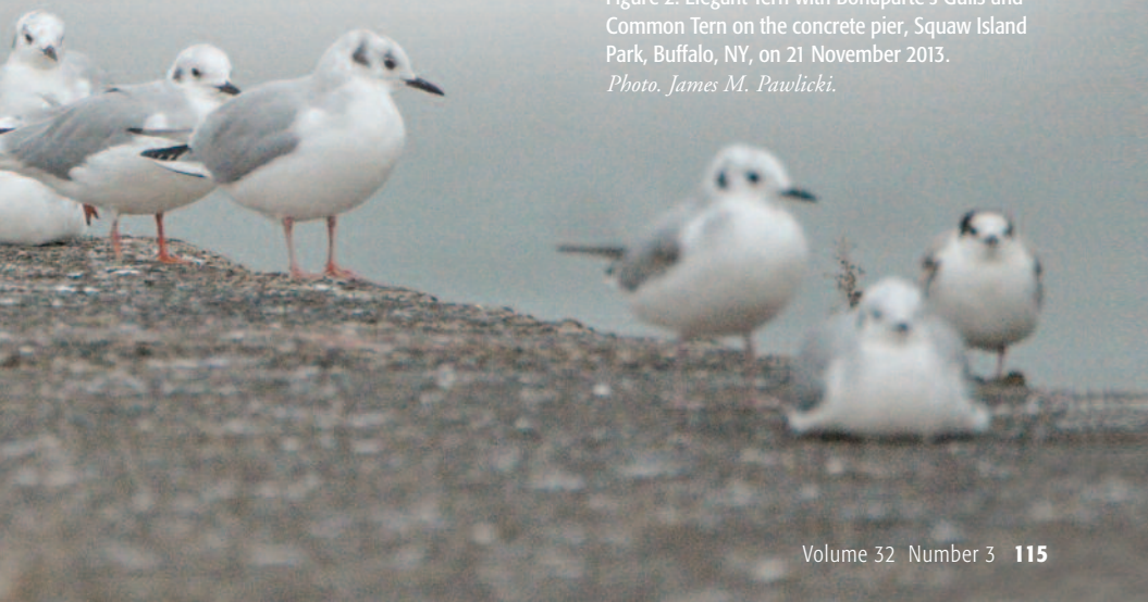
Figure 2. Elegant Tern with Bonaparte's Gulls and Common Tern on the concrete pier, Squaw Island Park, Buffalo, NY, on 21 November 2013.

At 1250h on 20 November 2013, Victoria Rothman of Youngstown, New York was bird-watching along the New York side of the Niagara River at Beaver Island State Park on Grand Island, Erie County. Weather conditions at the time were sunny with light east winds and temperatures around 4.5°C. While observing a flock of gulls sitting in the rocky shallows just offshore, she discovered a medium-sized tern with a bright orange bill that she identified as either an Elegant or Royal Tern ( Thalasseus maximus ). Knowing the great rarity of the bird regardless of species, she made a cell phone call to James Pawlicki. After describing field marks over the phone, it became evident that certain features, notably the small body size and thin bill, suggested that it was an Elegant Tern rather than Royal Tern, despite the latter being arguably the more likely of the two species to occur in the region.