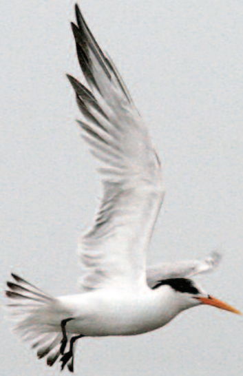
Figure 15. Elegant Tern over Black Rock Canal from Squaw Island Park, Buffalo, NY, 22 November 2013.