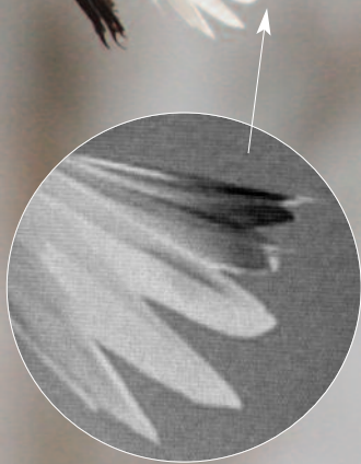
Figure 6. Elegant Tern over Black Rock Canal from Squaw Island Park, Buffalo, NY.