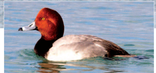
Glaucous Gull. Allen Woodliffe Redhead. Ann Brokelman

Gulls and waterfowl from the north concentrate here as the lakes freeze over. Late December to late February is the best time, and colder years tend to be more productive when there is an abundance of ice, while the outflows of power plants and industries will prevent a total freeze. This article identifies good vantage points along the St. Clair River, species seen in winter, and birds seen in the lower stretches of the river in early summer.