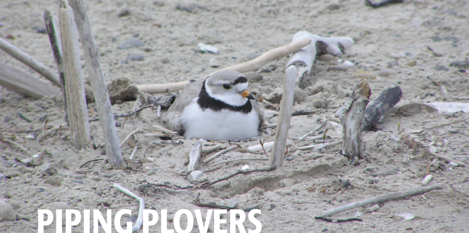
Male Piping Plover on the Port Elgin nest. Don Kennedy