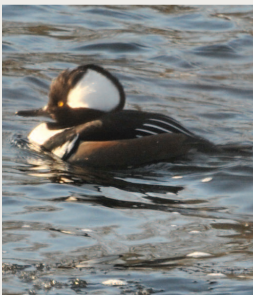
Hooded Merganser Male at Lock 19.

All these inland waterway sightings were the result of the Great Lakes freeze, not early migration of waterbirds from their southern wintering grounds in the Atlantic Ocean off Florida, Georgia and the Carolinas. Migrating birds would have returned north at the end of winter, in mid to late March.