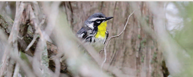
Yellow-throated Warbler. P. Allen Woodliffe