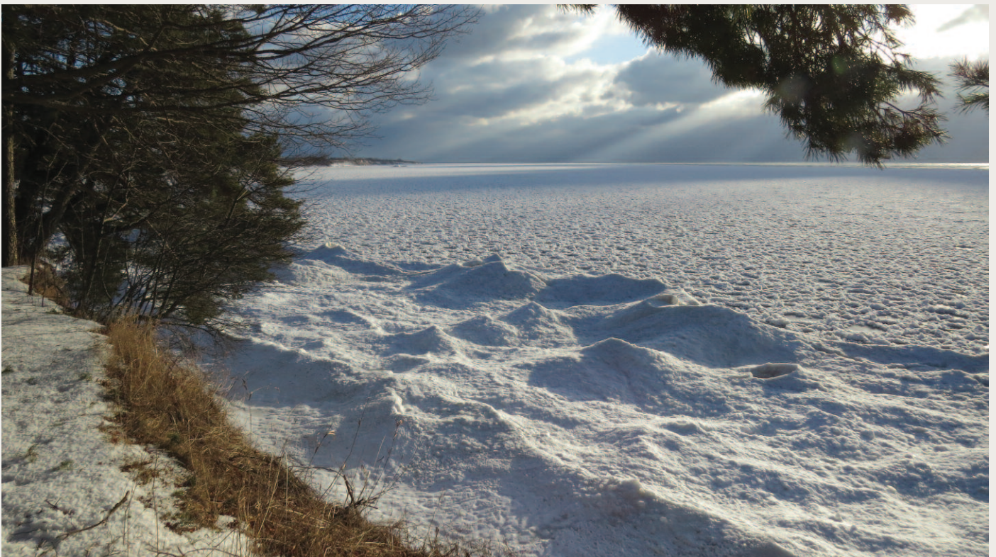
Lake Ontario off Thickson's Woods during maximum ice coverage. Glenn Coady

Two male Hooded Mergansers and a pair together at Lock 19 over-wintered on the Otonabee.