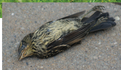
Red-winged Blackbird killed by cat.

What a lovely sight! Look at Patches as she heads out for her morning jaunt in the fields near her home. How cute is she as she tiptoes through the dew-drenched grass, trying her best to keep her paws dry, but to no avail.