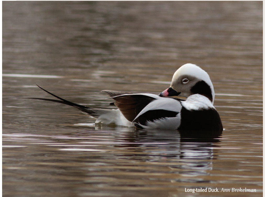
Long-tailed Duck. Ann Brokelman

The winter of 2013/2014 was remarkable for many reasons including the extremely cold temperatures and the amount of snowfall.