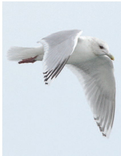
Kumlien's Gull. Duck Raft.