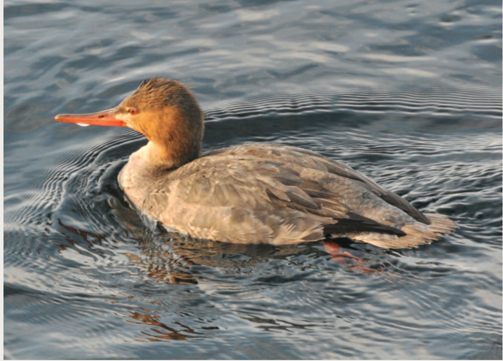
Red-breasted Merganser on the Otonabee River.