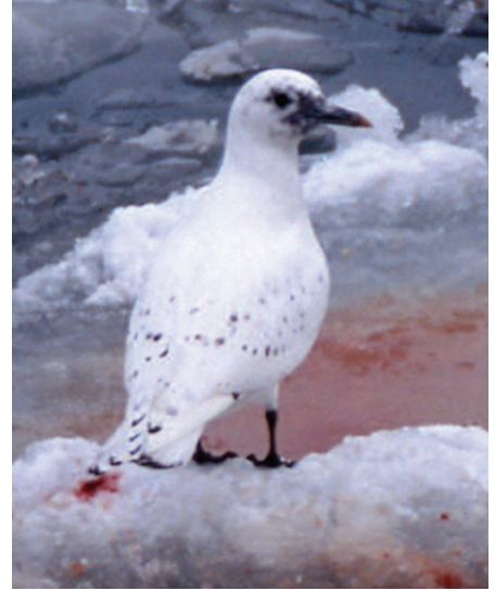
Ivory Gull. Steve Pike

The next little park, called Seager, is often sparse for birds but a cozy spot to stop for a look. It is the location where I found an Ivory Gull, one of the rarest birds on the river in recent times, on 23 December 1995. It stayed for three days, attracted hundreds of birders, and was later seen off the outflow of the fertilizer plant just north of Stanley Line where the water is almost always open.